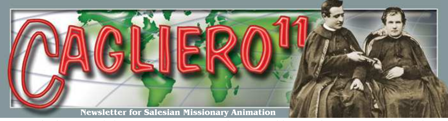
A Publication of the Mission Department for the Salesian Communities and Friends of the Salesian Mission